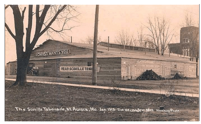
Aurora, Missouri Tabernacle

Note the tabernacle was built preserving one or more trees.